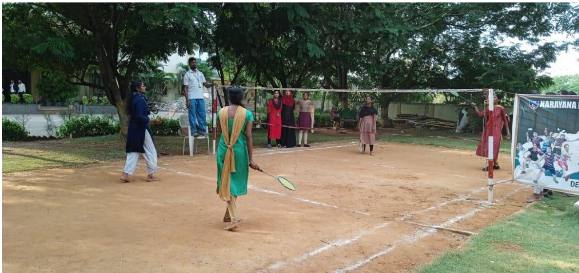
Playing Badminton by girls