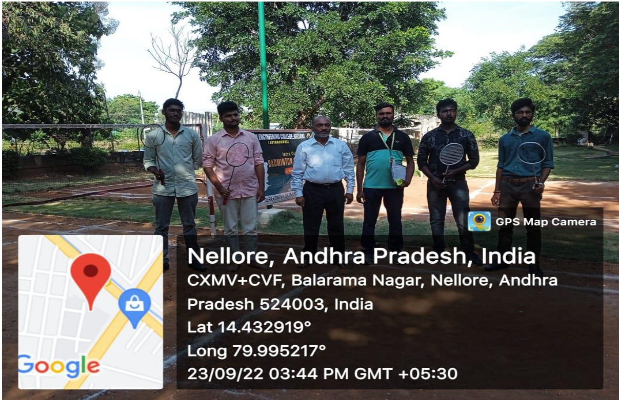
Chief Guest with Players