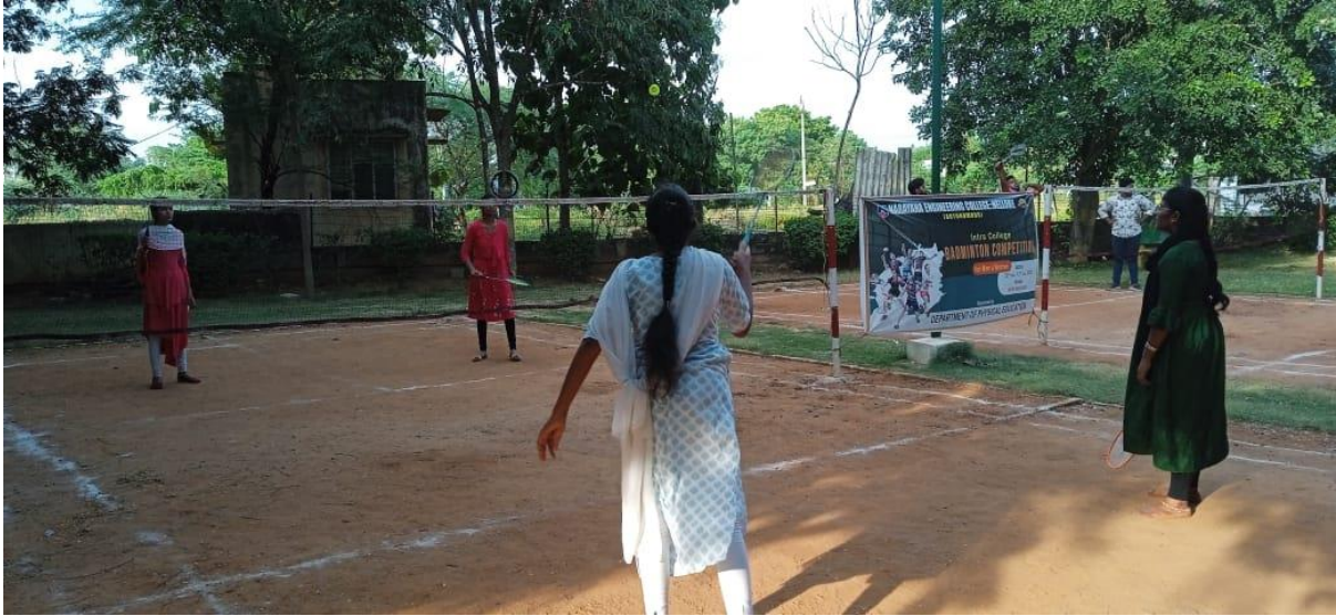
Playing Badminton by girls